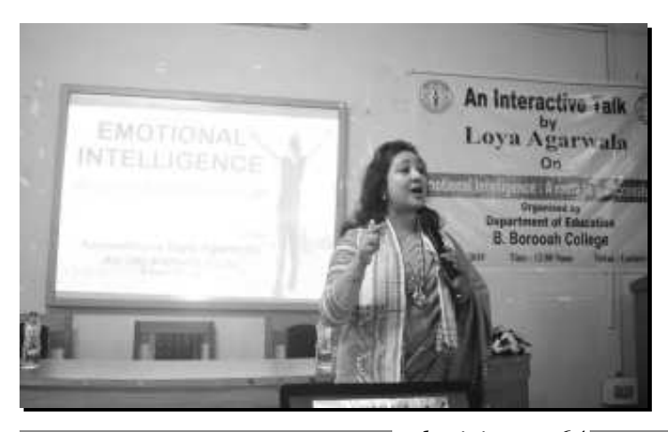
eduvision ● 64